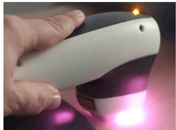
The epilation handpiece of the Asclepion MeDioStar NeXT laser with integrated Peltier cooling element

Several laser units (800 and 950 nm) are integrated into the handpiece of our high-power laser, which emits energy in parallel. The success of the treatment can be seen by a slight redness (perifollicular erythema) or swelling (edema) of the hair follicle.